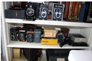
Some of the TTLs from the Tremblay Collection